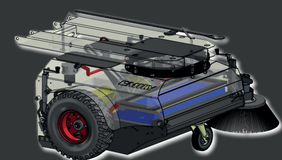
High Performance Suction and Filtering System