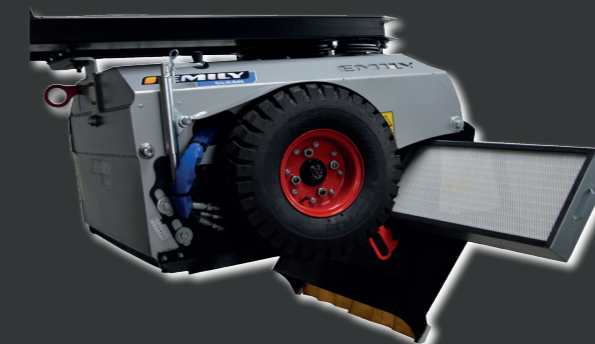
Automatic filter cleaning